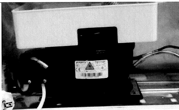
After January 2020