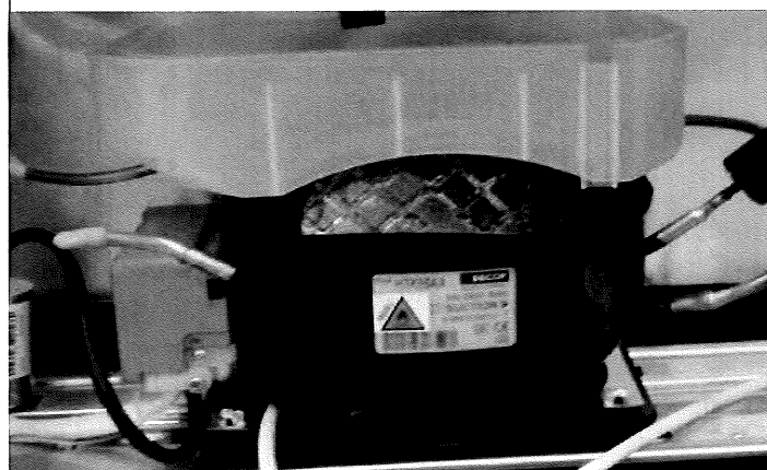
Before January 2020

TECHNICAL EXPLANATION OF THE CHANGE Issue Compressor replacement Explanation: Replace compressor HTK 95 from Secop with TG1114YL from JIAXIPERA for F60312N A+ / F60312NE A+ (7518620003; 7518620001; 7517520001; 7517510003; 7517510002; 7517510001).